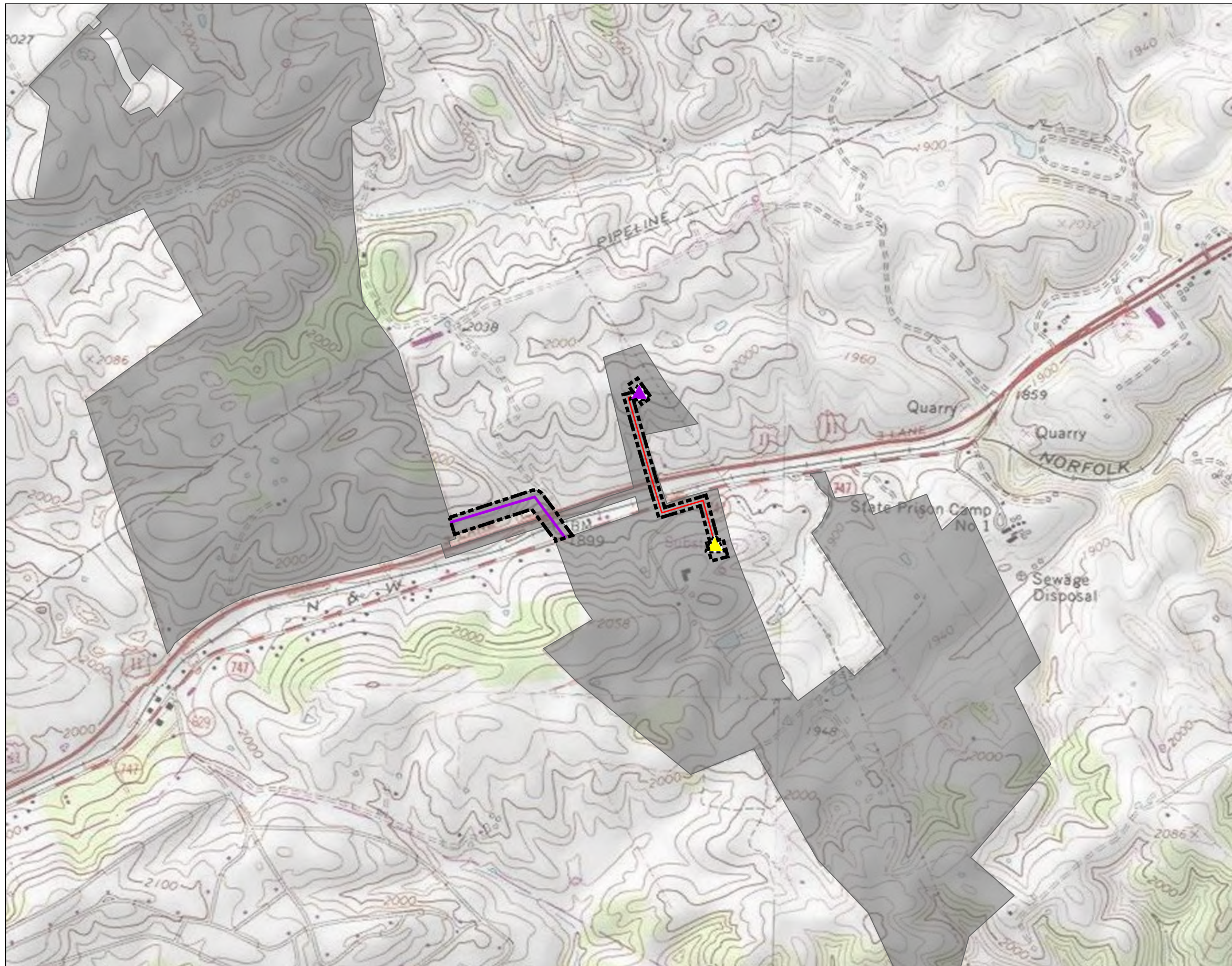
Figure No. Exhibit 6.B Title Topographic Map of Transmission Facilities

U:\203401765\03_data\03_ead\03_01765_scc.dwg Revised: 2024-08-16 By: lkutz